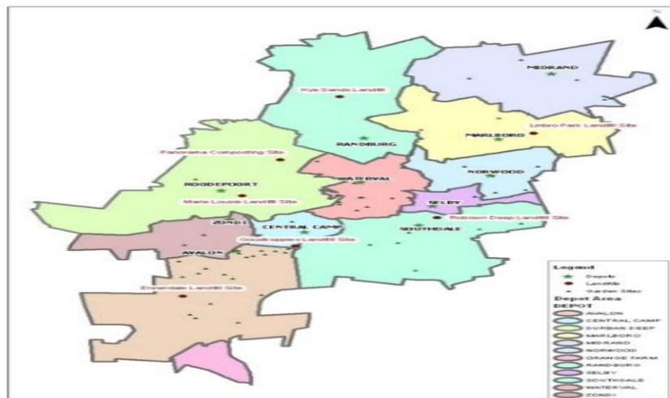
Figure 1: Pikitup COJ Areas

Pikitup executes its mandate to the City of Johannesburg and its residents through 12 Depots, 4 Landfills, 42 Garden sites and 4 Buy Back Centers.